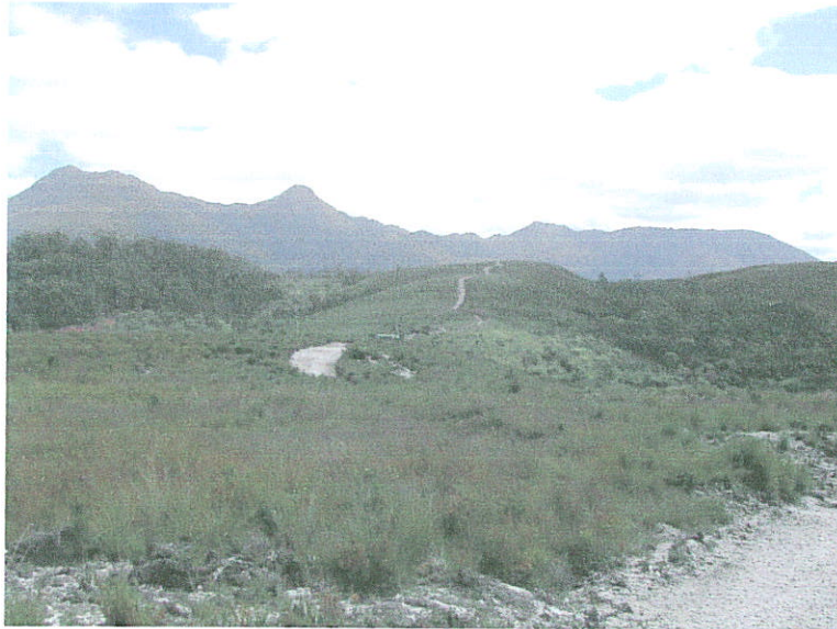
Photograph of survey area. Taken by Rocky Sainty, 27 February 2006